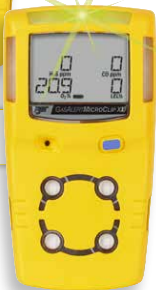
GasAlert MicroClip XL

NEW! GasAlertMicroClip X3 and GasAlertMicroClip XL now feature IP68 for maximum water and dust protection — up to 45 minutes at a depth of 1.2 m.